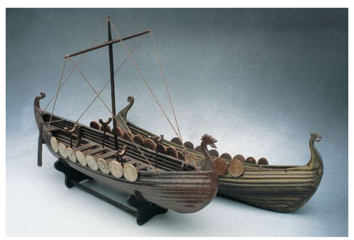
"Viking Vessels," 22 inches in length, extruded hulls, with handbuilt and press-molded additions.