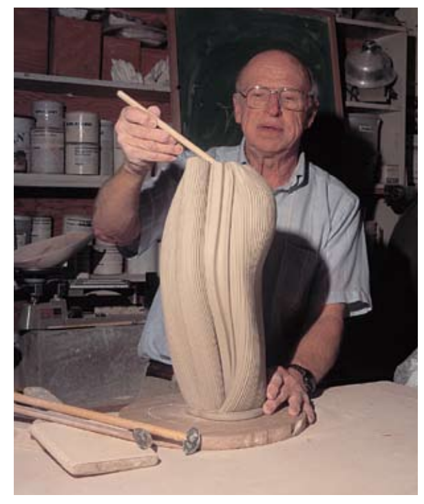
A stick with a metal rib attached to the end is ideal for shaping and refining from the inside of a tall extrusion.