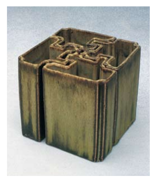
"Four-Piece XTR Vessel," 6 inches square, extruded white stoneware, with slab base.

The creation of certain representational forms is ideally suited for an extruder as well. Boats, for example, are easily made by the process. While a submarine shape was not much of a challenge, a sailing ship was much more difficult. A die patterned after the cross section of a Viking vessel produced a shape that could be easily pinched into the familiar upturned bow and stern. Filed grooves in the die produced