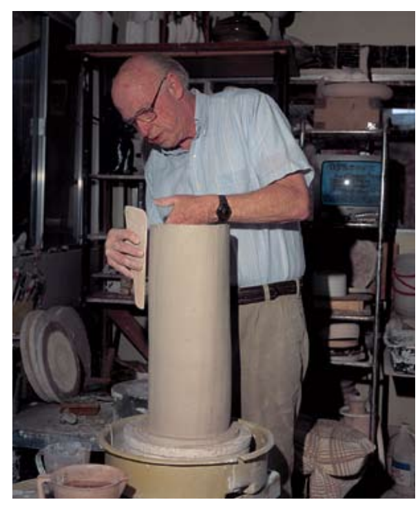
For large-scale items, a cylinder can be extruded and attached to a thrown slab, then shaped into a vessel.