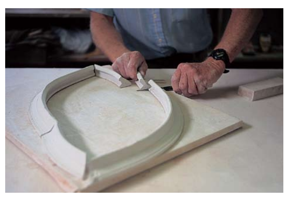
Extruded ridges can be shaped to form the edge of a hump mold. After a bisque firing, they will be glued into position, and the space filled with plaster to complete the mold.