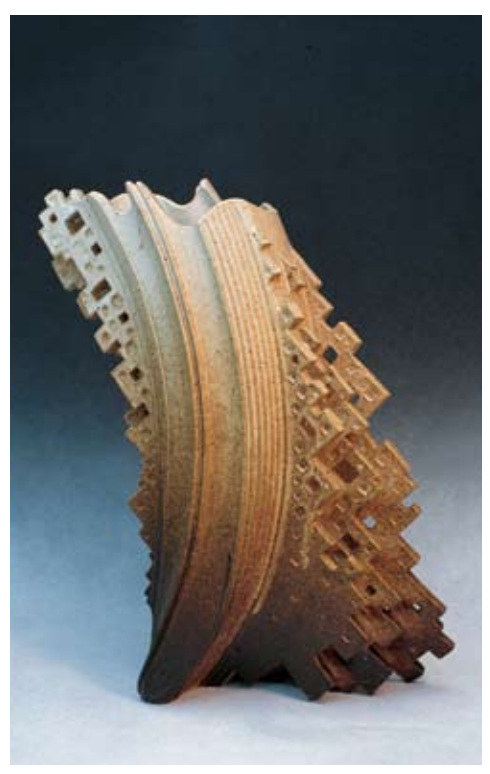
"Cantata," 14 inches in height, stoneware extrusion, carved when leather hard, fired to cone 10.