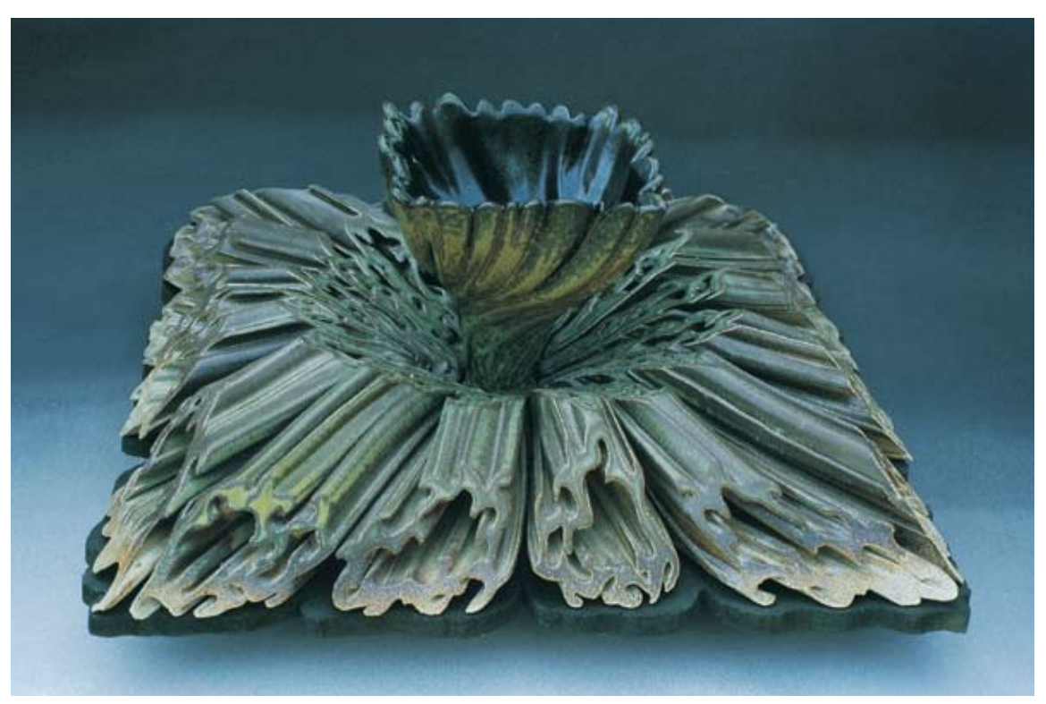
"Tourbillon Carré," 10 inches in height, extruded stoneware, center piece thrown and altered.