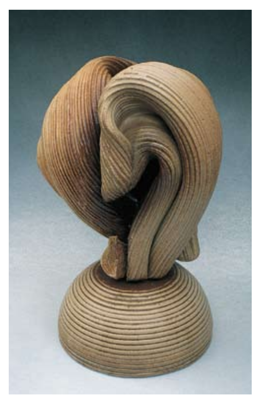
"Brisighella Babe," 18 inches in height, extruded white stoneware on thrown base.

In the field of studio ceramics, the extruder generally has been thought of as a mechanical device for creating simple tubular shapes or for squeezing out straps of clay for handles. Few ceramists have really taken advantage of the extruder's ability to create original forms and, after the initial excitement of squeezing out round and square pots wears thin, often have relegated it to an out-of-the-way corner of the studio or classroom. That's too bad. With a little experimentation, they should be able to extrude