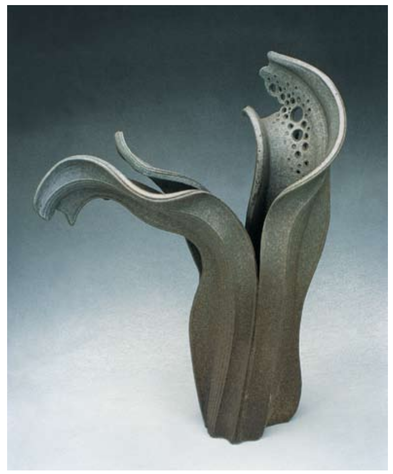
"L'Envolé III," 22 inches in height, extruded, split and altered white stoneware and glazed.